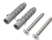
Wall mount set