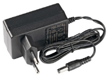
24 V 1.2 A power adapter