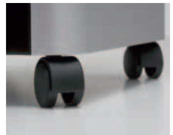
Mounted on rollers for flexible use