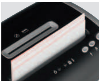
The perfect data protection: wheter paper or multi-media

Do you keep your customer's records private? You have a legal responsibility to keep your customer's private data secure. How could you explain to one of your customers that their private information has got into the wrong hands? Always use a intimus® shredder for safe disposal of unwanted documents.