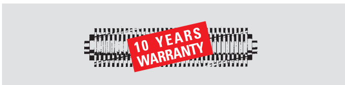
...on fracture of cutting cylinders.